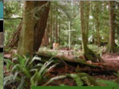
Chapel in the Woods