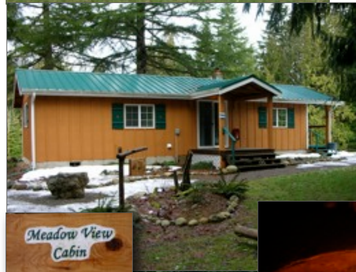
Meadow View Cabin