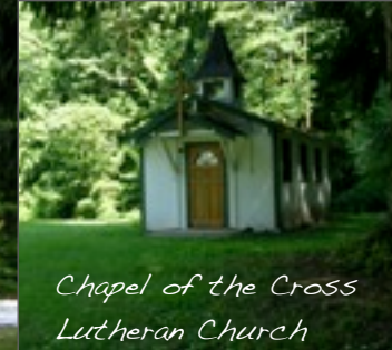
Chapel of the Cross Lutheran Church