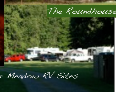
Upper Meadow RV Sites