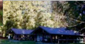
Cedar Grove Picnic Shelter